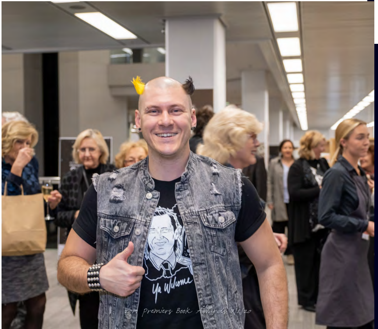
Image Credit: Holden Sheppard, Winner – 2019 Western Australian Premier's Award for an Emerging Writer.

The Chamber of Arts and Culture WA Incorporated ABN 83 149 126 786