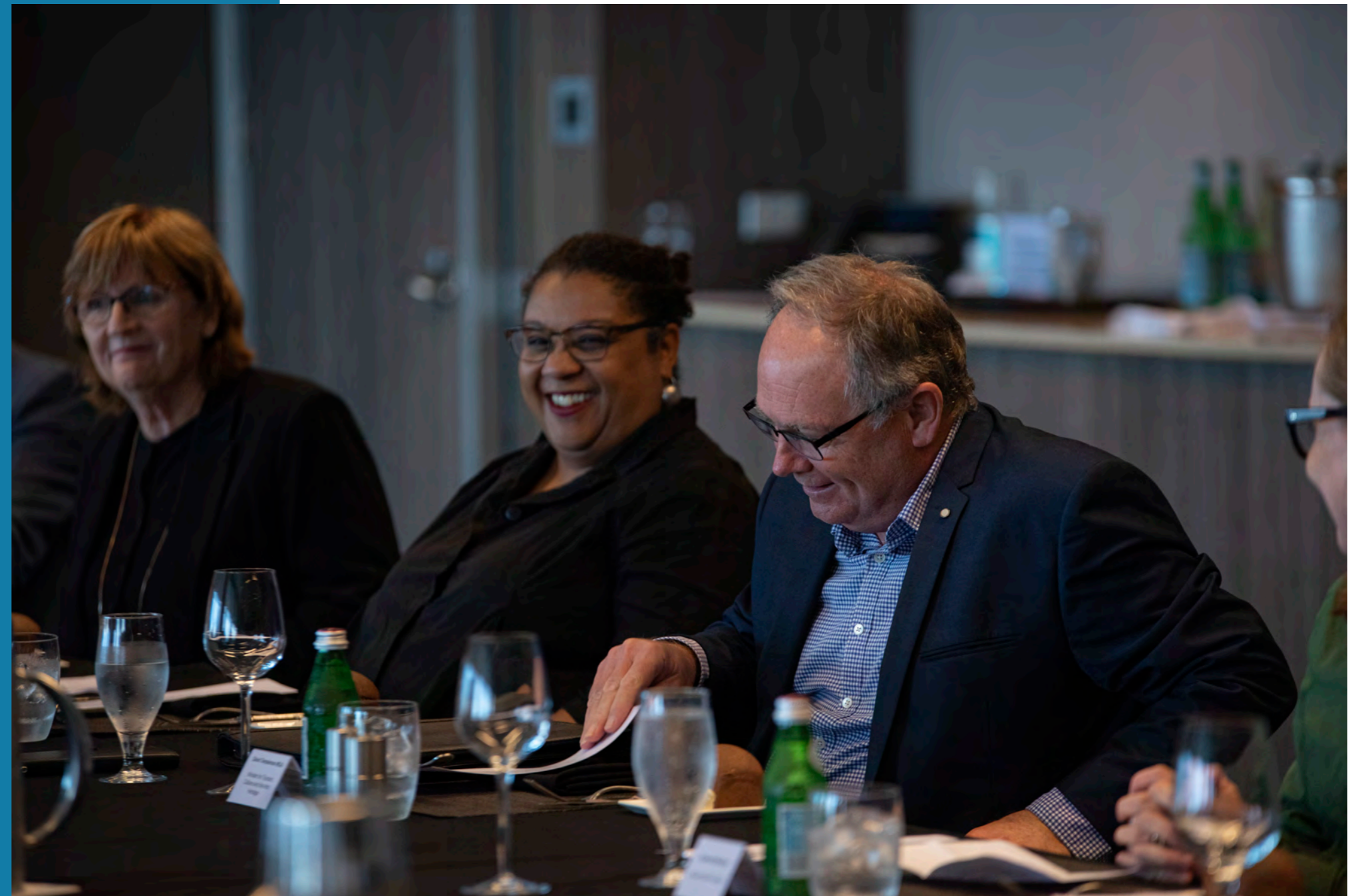
Image Credit (Below): Minister for Tourism; Culture and the Arts; Heritage Roundtable. Photo by Dana Weeks.

Images Credit (Pg 14 & 15): A Spotlight on WA's Independent Arts Sector Event. Photos by Mark Brierley.