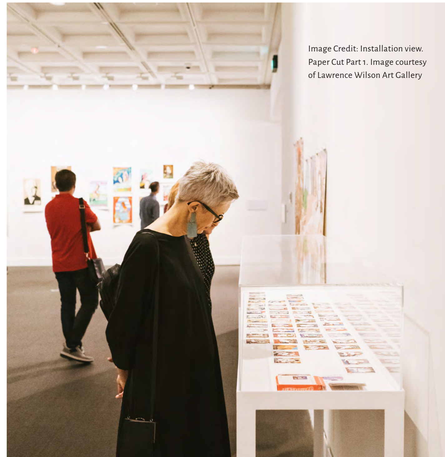
Image Credit: Installation view. Paper Cut Part 1. Image courtesy of Lawrence Wilson Art Gallery

In September 2020 we announced a new membership category for independent artists to encourage greater representation of artists and ensure the specific challenges and needs of independent artists are understood and articulated as part of the Chamber's advocacy priorities.