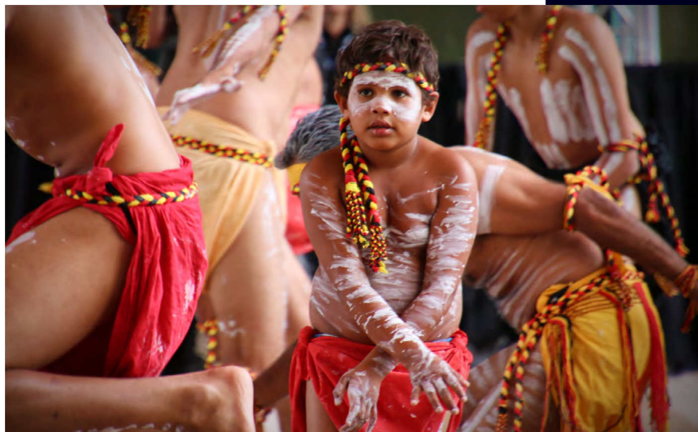
Image Credit (Front Cover): Boola Bardip Opening Event. Wadumbah Dance Group. © Gian de Polini.