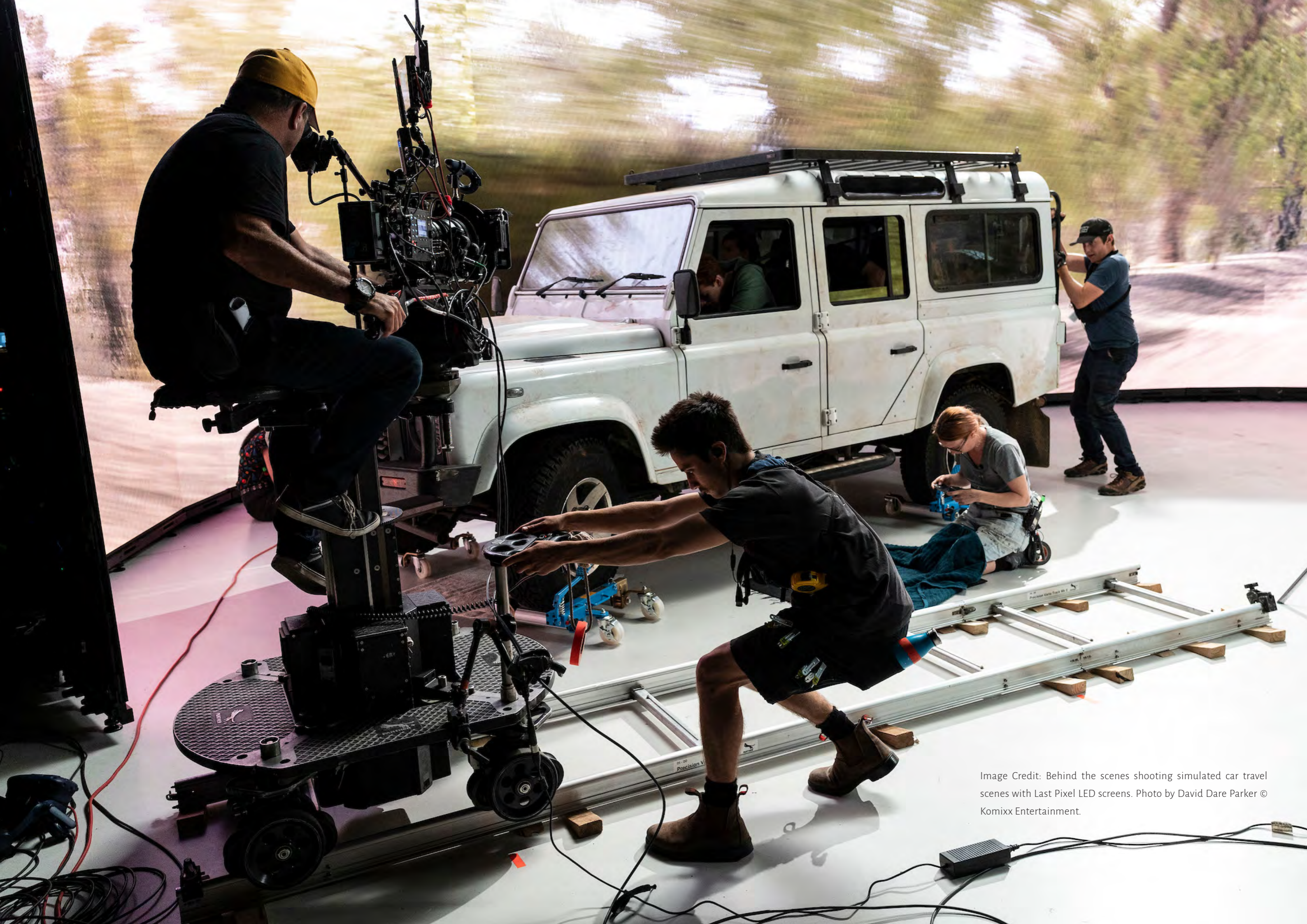
Image Credit: Behind the scenes shooting simulated car travel scenes with Last Pixel LED screens. Photo by David Dare Parker © Komixx Entertainment.