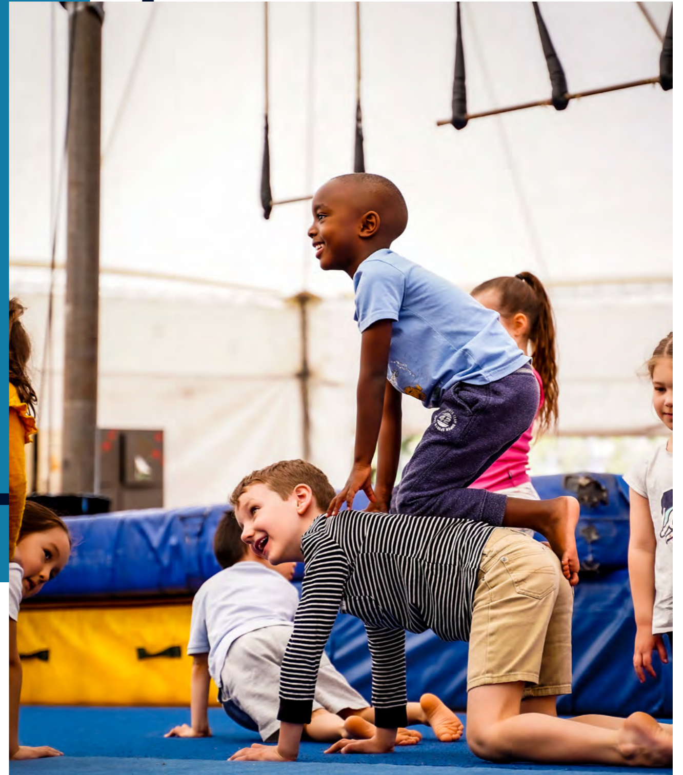
Circus WA Workshop.